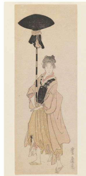
Young Woman Carries Adorned Pole for a Procession

Utagawa Toyohiro c. 1805 Woodblock Print