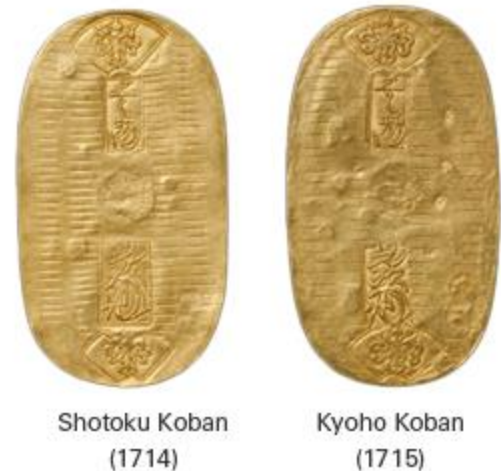
Gold coins made during the Edo Period