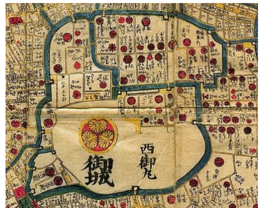
Map of Edo castle with Shogunate and Dai